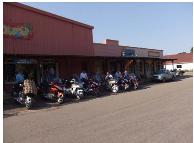
Chapter A Riders in Patagonia