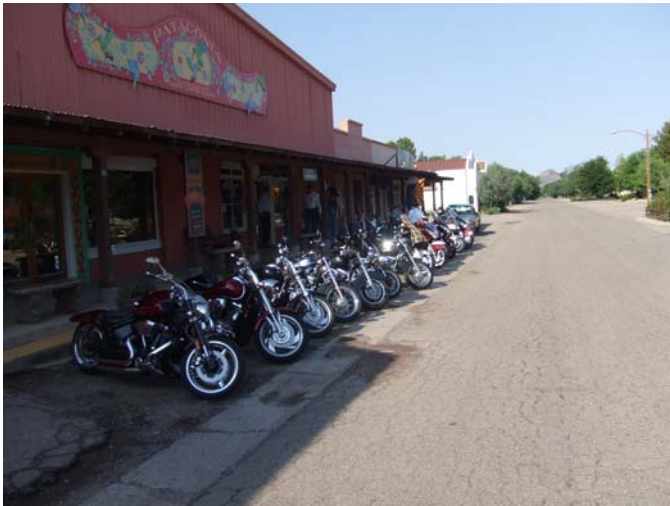
Looks like a Mini Rally (More bikes were on the other side of the road)