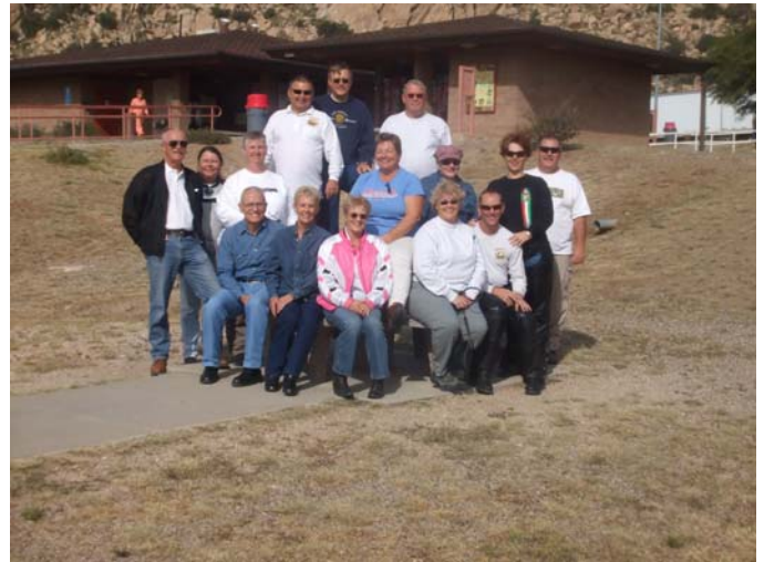
Part of the Silver City contingent