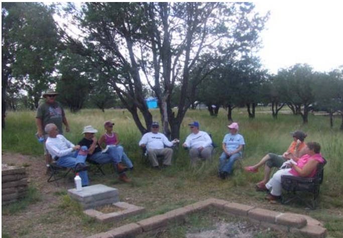
Relaxing and Socializing at Parker Canyon Lake