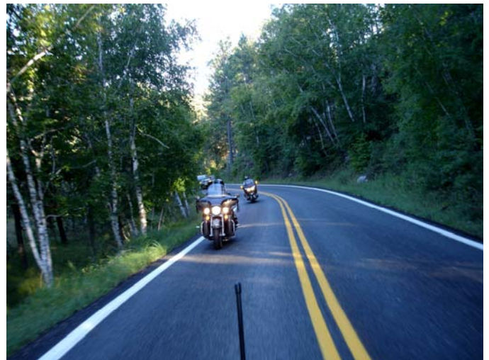
Riding the Black Hills (Custer National Park) Smitty is 2 nd bike back