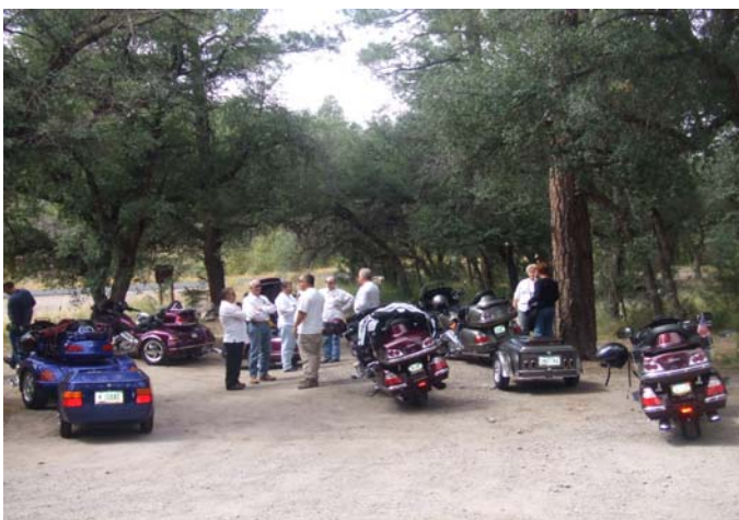
Break time at Mule Creek NM