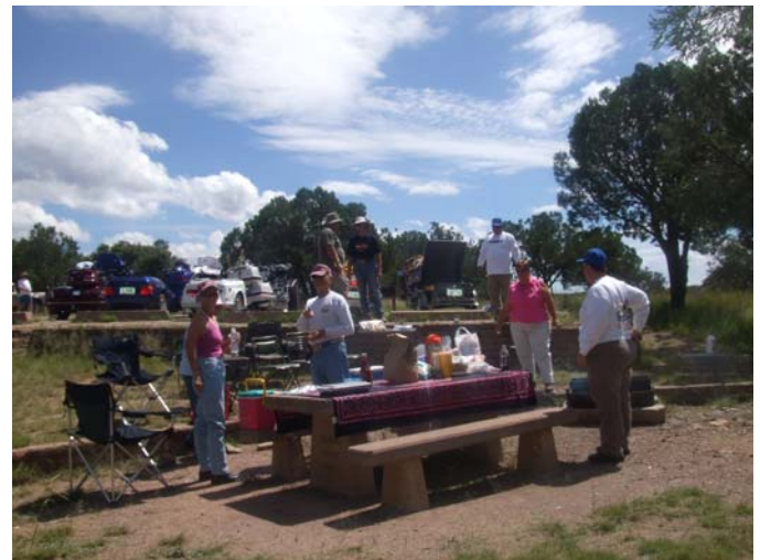
Chapter A members milling around the awesome spread

We had a kick back day in no hurry to be anyplace at any particular time. Just the way days out should be – next time we sure would like all that missed this wonder day to join in!